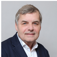
Jean-Dominique Daudier de Cassini